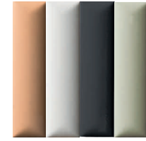
50 x 200 Dune