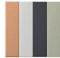
50 x 200 Plan