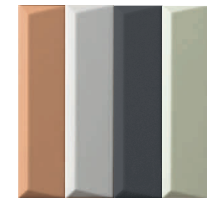
50 x 200 Peak

Note : Each Colour & Each Design separate box packing available.