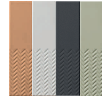
50 x 200 Waves