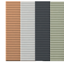
50 x 200 Strips